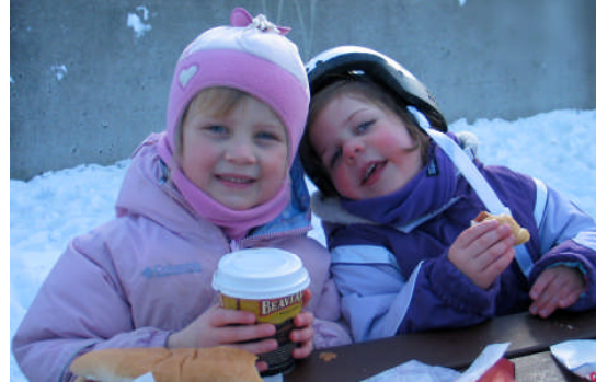
Cousins—Best friends for life!

Have a special moment you captured on film? Send it along!