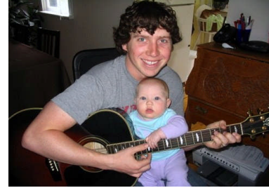
Music Lessons From Daddy