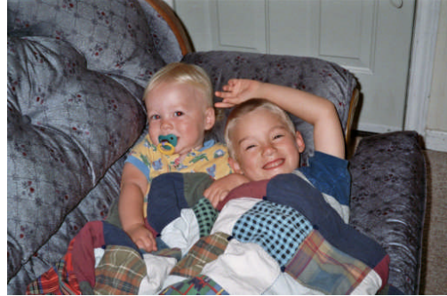
The joy of being brothers!

Have a special moment you captured on film? Send it along!