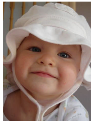
Life is good!